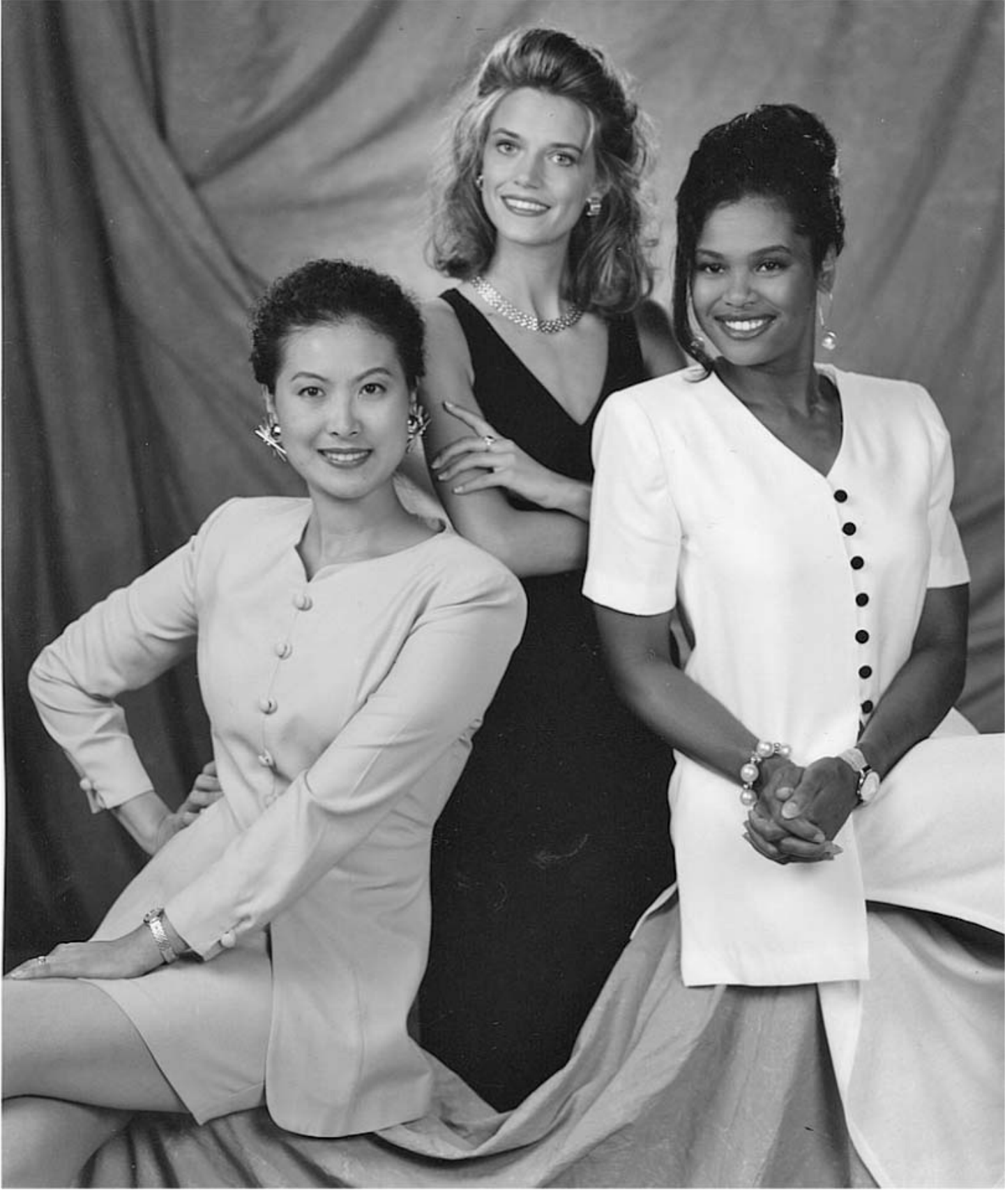
Figure 3.2 Diverse Shirley

Source: Kodak multiracial Shirley card, 1996